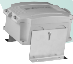
WD-100 - Water Detector Standalone