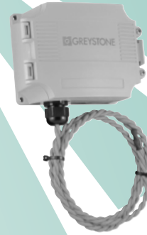
WD-100-XX - Water Detector c/w Conductivity Cable