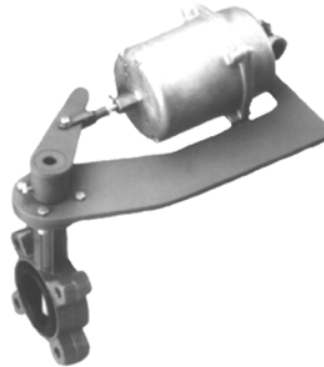
Two-Way VF Series Butterfly Valve with D-3153 Actuator