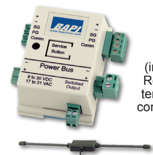
Relay Output Module (includes the Relay Output terminal block connector only)

Both Relay Modules receive data from a BAPI 418 or 900 MHz Receiver through a four-wire bus. Up to 127 different Modules can be connected to a single receiver to send multiple variables to the controller. The Relay Modules are easily trained to a single transmitter variable with a pushbutton and LED. The RYOM is surface, 2.75" snaptrack or 35mm din rail mountable.